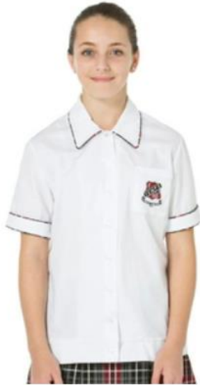
S/S White Blouse-Jnr