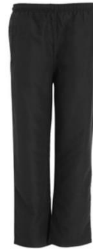
Black Microfibre Trackpants