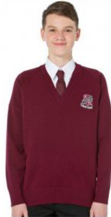
Maroon Wool Blend Pullover