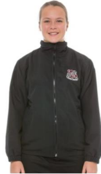
Black Microfibre Jacket