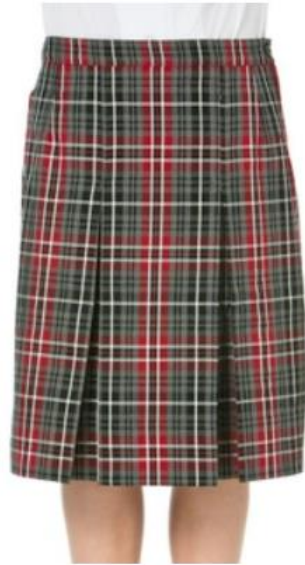
Check Pleated Style Skirt