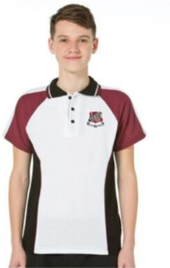
White/Maroon/Black Polo Top