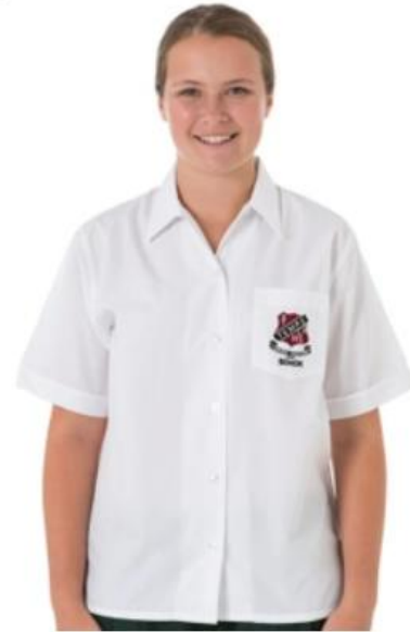
S/S White Blouse-Snr