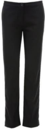
Ladies Black Tailored Pants