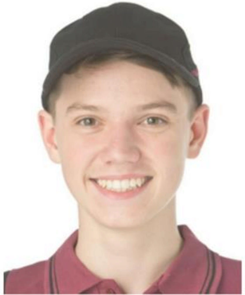
Black Baseball Cap