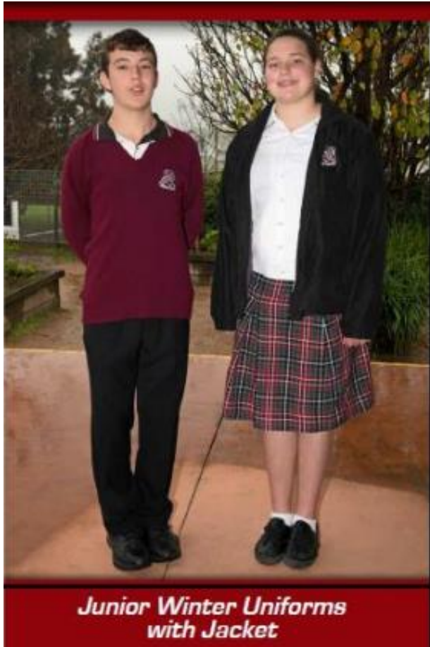
Junior Winter Uniforms with Jacket