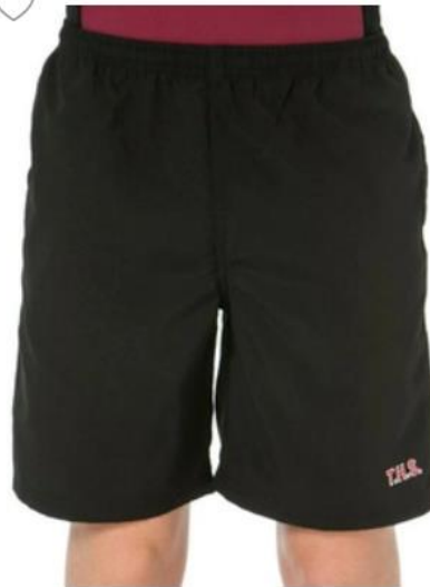
Black Microfibre Shorts