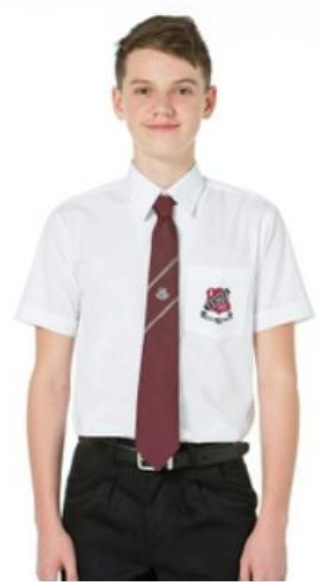
S/S White Shirt