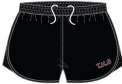
Black Stretch Sports Shorts