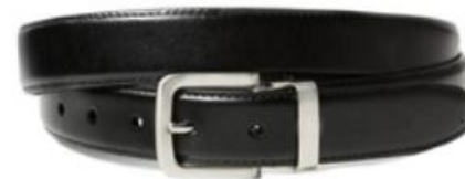
Black Leather Belt