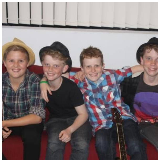
'Chillin in the dressing room' - Sydney Opera House