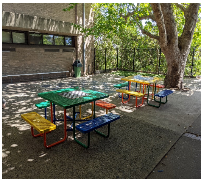
New Seating near D Block