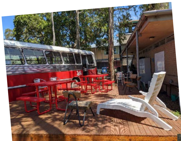
New furniture for our Bus Hub