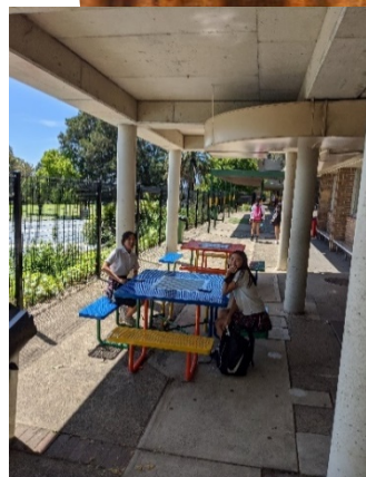
New seating near E Block