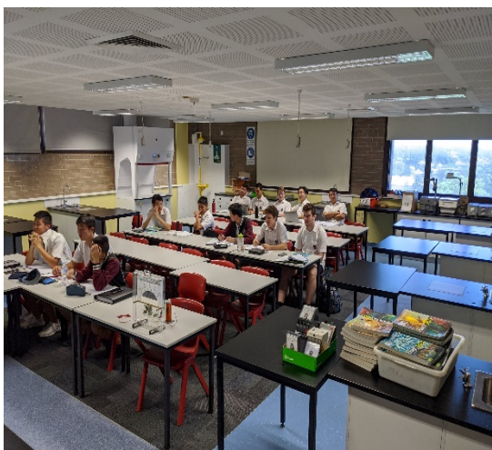
New Lab D10